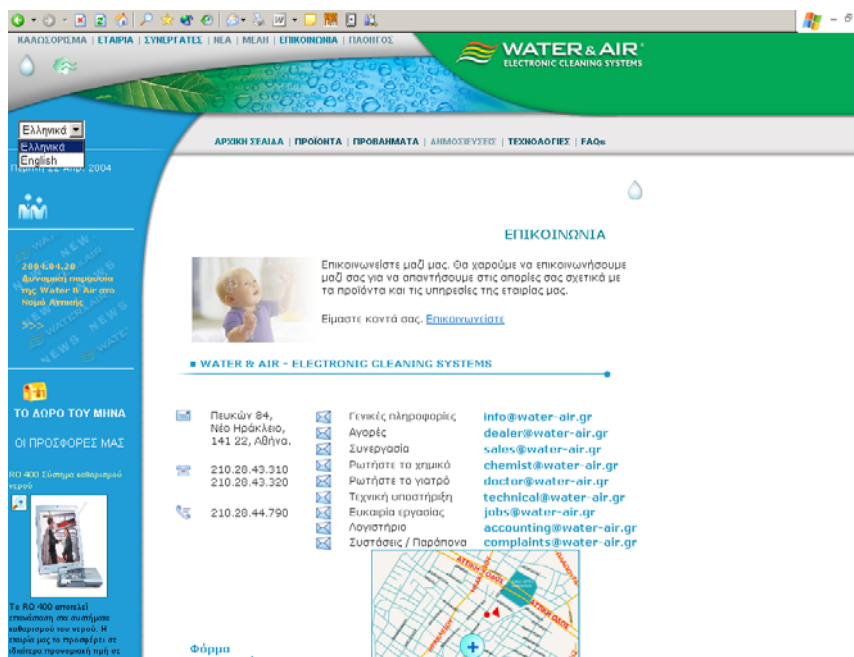
Screen 5 – Presentation of the dynamic content page on the company web site.

Headquarters: NetHabilis, 14, Nikitara Street, GR-106 78 Athens, Hellas, EU. www.nethabilis.gr | info@nethabilis.gr